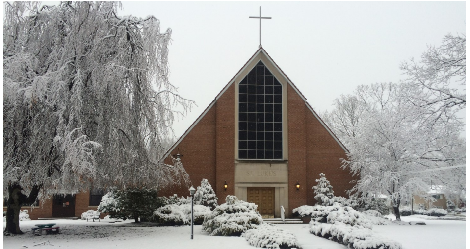
St. Luke's, February 2016

The following article has been edited from the Wardens' Report submitted for the St. Luke's 96 th Annual Parish Meeting, which was held on Jan. 28, 2018. – Eds.