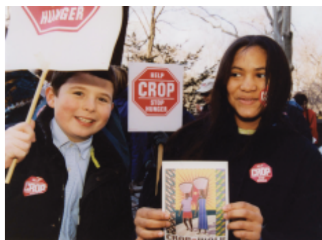
This year's annual CROP Walk will be held Sun., Oct 17. Don't forget to sign up!

Do you have time on October 6 th from 3 to 6 p.m. ? If so, could you help serve a meal to some 150 needy folks in Hackensack at the next Walk-in Dinner? If you haven't got that time free, can you cook? If so, could you help make a dinner at home and bring it over to St. Luke's to be transported and served there? A recipe will be provided.