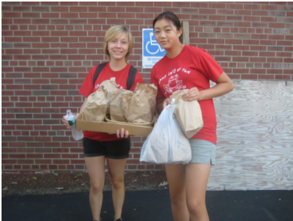
Camp Lots of Fun counselors gather bagged lunches for the participants

Thanks to those who collected back-to-school supplies for the children of the Women's Rights Center clients.