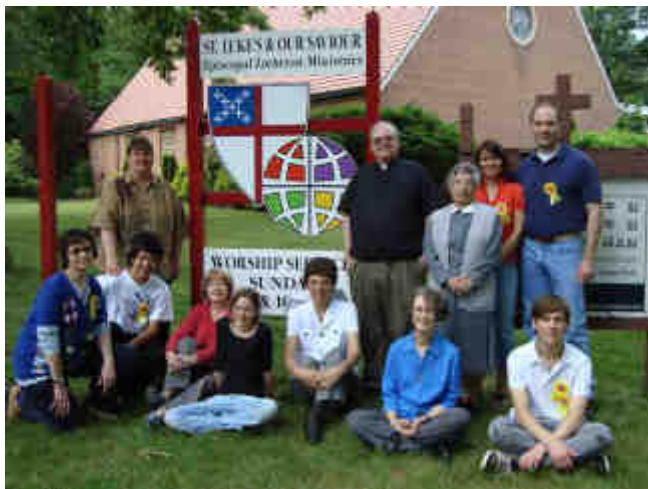
At left: Members of St. Luke's and Our Saviour (and our guests from the Sisters of Zion) posed in front of one of our new signs.