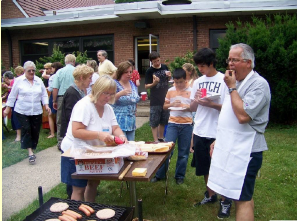
Great food and loads of hospitality are always in evidence at St. Luke's & Our Saviour, especially at the Annual Outdoor Service and Picnic. Check it out -- there's more fun inside!