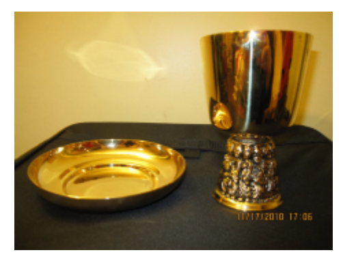
Dear Members of Our Saviour.

Thank you so much for the chalice and paten that you gave me on my last Sunday with you. The twelve surround Apostles the base. Because the gift was given to me during the last worship service and before Holy Communion. chalice and paten were used for the Lord's Supper. What a wonderful and moving experience it was to have you receive the bread and wine from your gift.