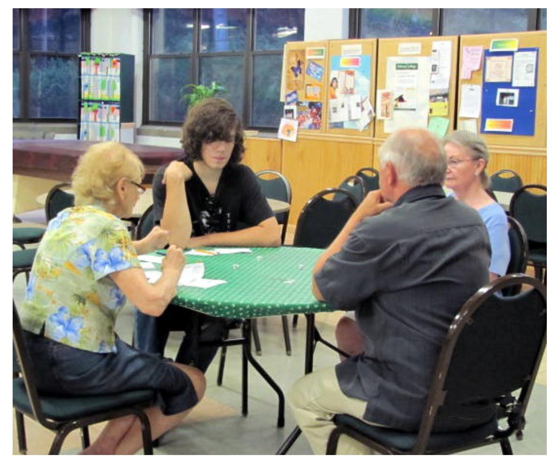
Healthy competition over board games can get surprisingly fierce on Family Fun Nights. Check it out inside!