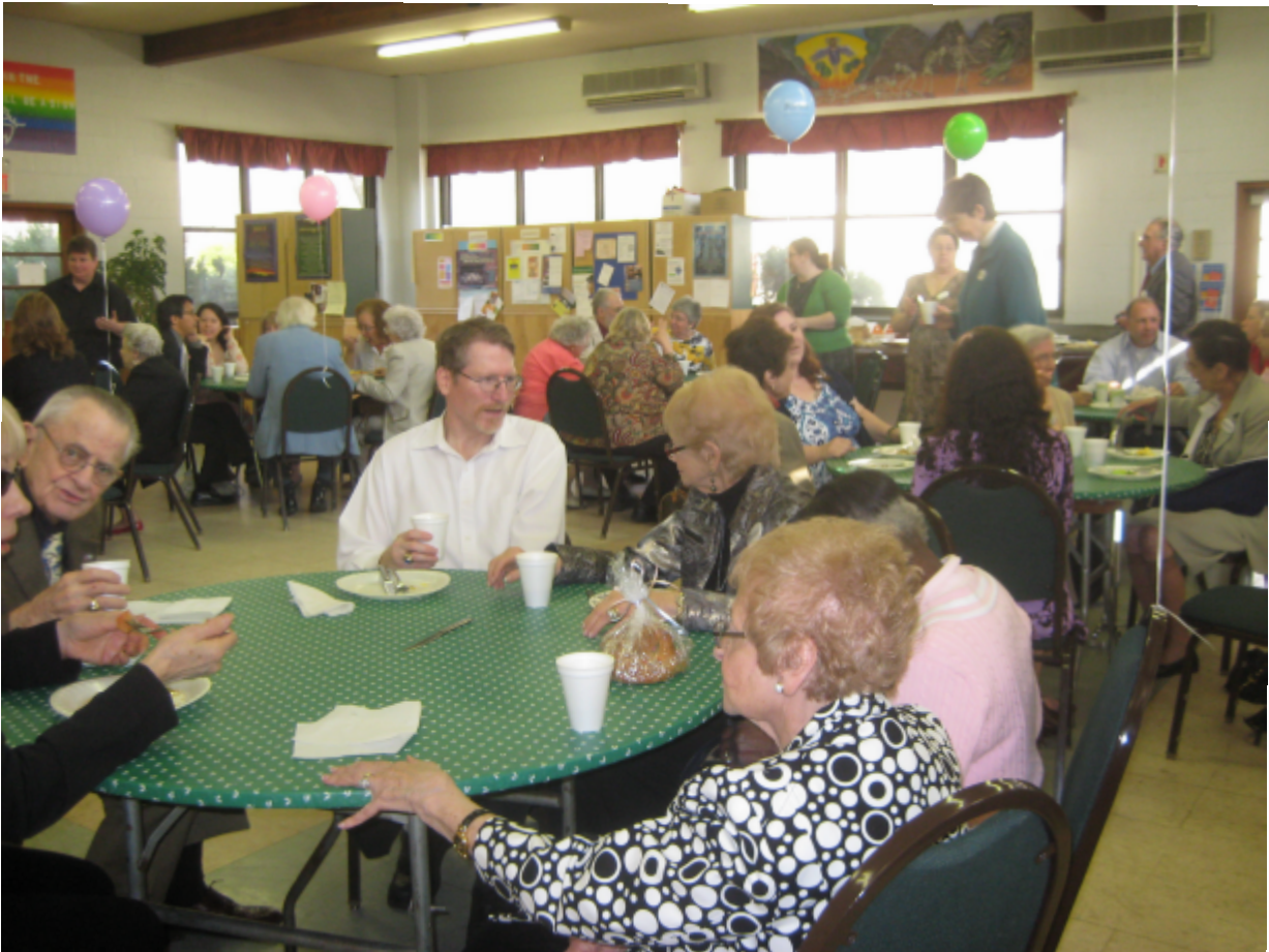
Breakfast together on Easter morning -- St. Luke's parishioners share in an Our Saviour tradition. Visit with us inside!